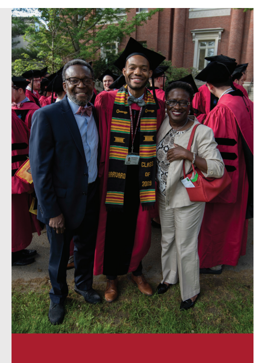
Learn more at gsas.harvard.edu/diversity/outreach-programs

Participating in research can help you decide whether a PhD is right for you and, if you do apply, makes you a stronger applicant. If you are looking for a short-term research experience, consider a paid summer internship organized by Harvard Griffin GSAS, Harvard departments, and Harvard-affiliated teaching hospitals. The School also offers a post-baccalaureate program, the Research Scholar Initiative, which enables college graduates to take part in a long-term research experience.